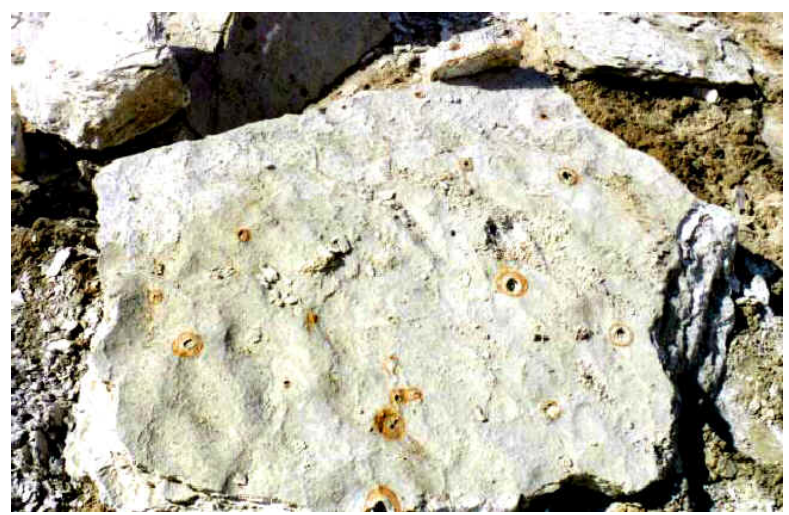
Millions of round impacts are all over the site of Sodom & Gomorrah.