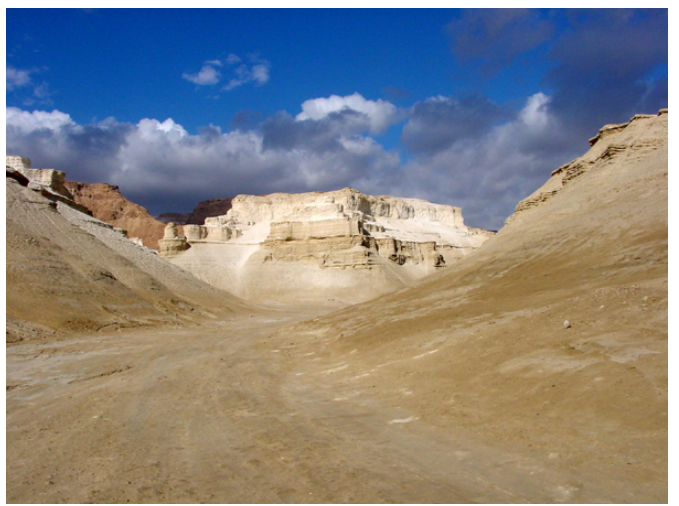
Entrance to the ruins of Gomorrah.