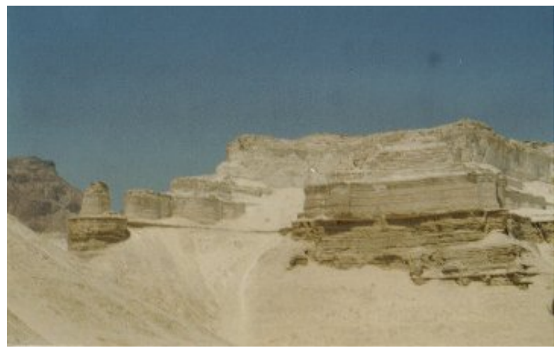
The building ruins of Sodom as it exists today.