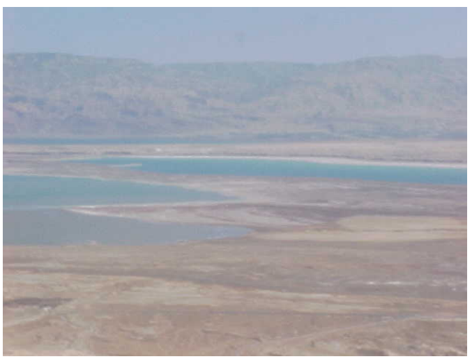
The dead sea of Israel; view from the town of Masada.

The location of Sodom & Gomorrah is to the far right, at the southwest end of the dead sea.