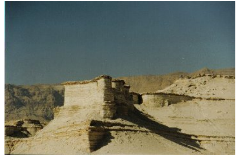
The building ruins of Gomorrah as it exists today.