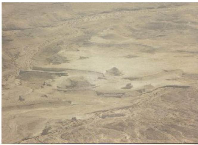
The desolation of Sodom & Gomorrah, view from the town of Masada.

The location of Sodom & Gomorrah is to the far right, at the southwest end of the dead sea.